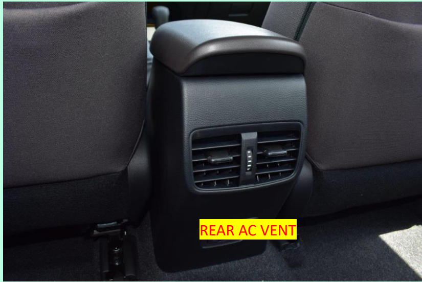
REAR AC VENT