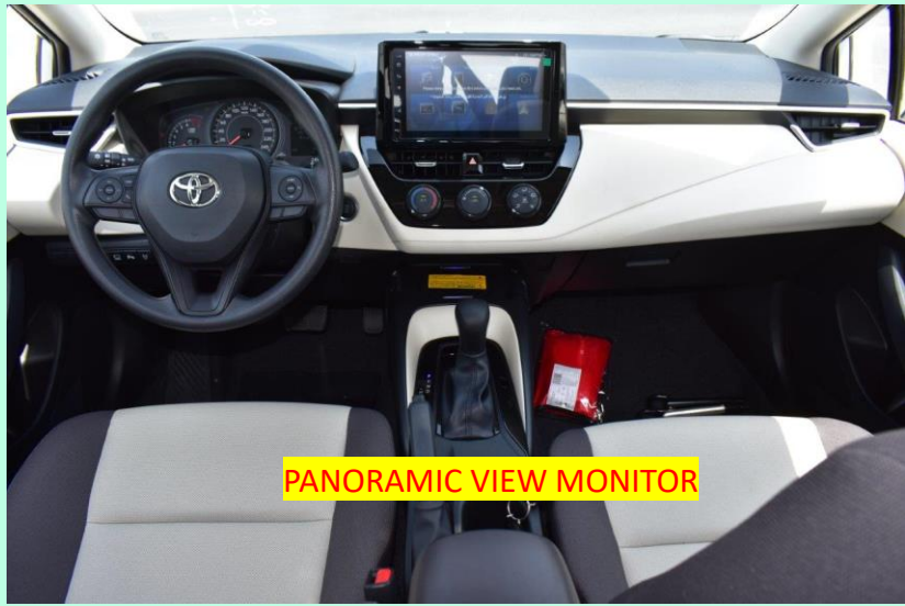
PANORAMIC VIEW MONITOR