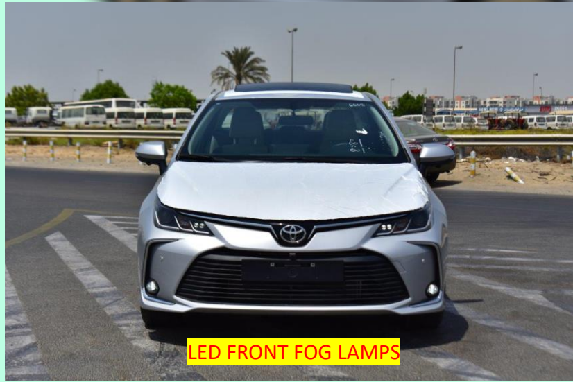
LED FRONT FOG LAMPS